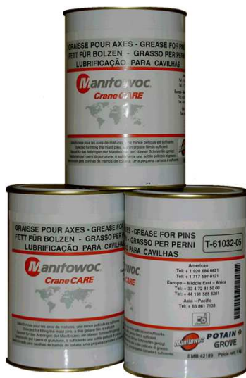
T-61032-05 Can 1 kg