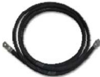
25 meter (82ft) Air Hose P/N 03329072