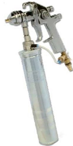
Specially Designed Grease Gun P/N 03329027